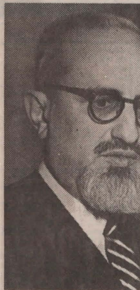
Rabbi Joseph Dov Soloveitchik