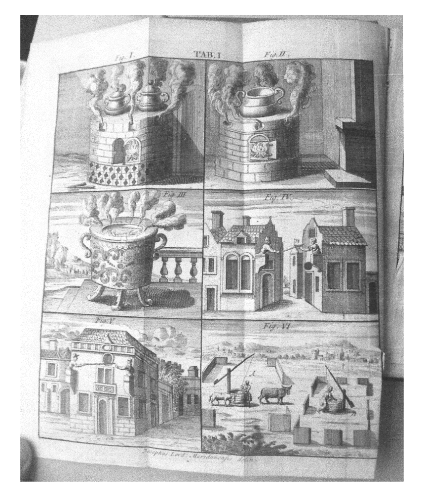
Fig. V. Here are two Balconies in the same house, with the Street underneath. One Man in one Balcony holds forth a Stick to another Man in the Second, who reaches out his Hand to take it from him. Shabbath , XI. 2.